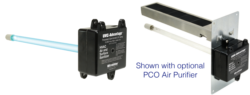
Shown with optional PCO Air Purifier